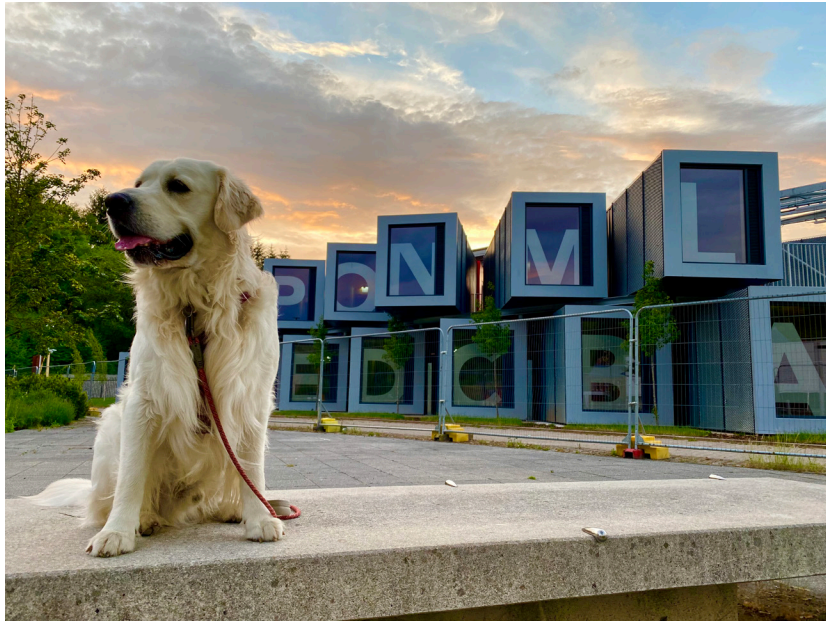
Cover Photo: "Box Units", Ebbw Vale.